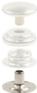
#24 Ligne Snap Fastener - POST

Finish: Nickel Plated (Brass), Pack Size: Pack of 100