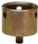
Eyelet Machine Chuck Dies (SP4) Type: Top