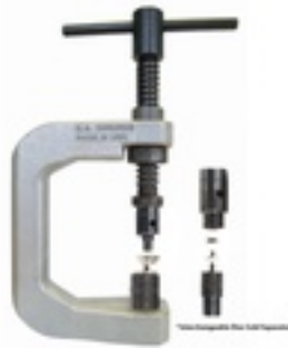
C.S. OSBORNE Portable It's-A-Snap Press #W-50