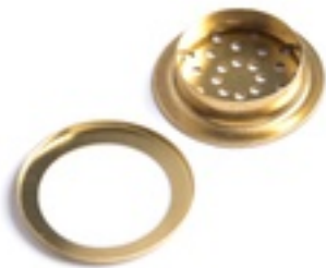
Brass Ventilators 25mm (1inch)