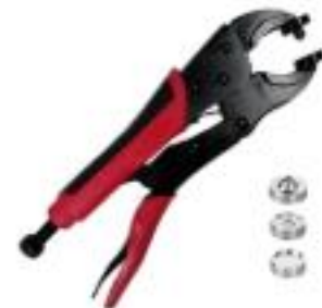
TUF SnapMate Press Stud Hand Pliers