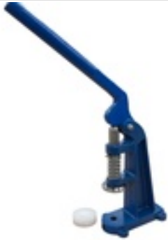
#L1 Handy Lever Button Press Machine