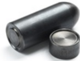
OSBORNE Ventilator Setter #621 1 inch