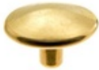
#24 Ligne Snap Fastener - CAP

Finish: Shiny Brass (Brass), Pack Size: Pack of 100