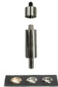
Eyelet Die Set (to suit Press Machine) Size: SP3