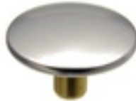
#24 Ligne Snap Fastener - CAP

Finish: Shiny Brass (Brass), Pack Size: Pack of 100