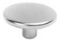
#24 Ligne Snap Fastener - CAP

Finish: Nickel Plated (Brass), Pack Size: Pack of 1000