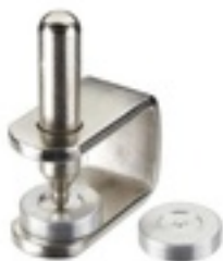
Osborne #230 Anvil Snap Setter #24L