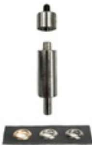
Eyelet Die Set (to suit Press Machine) Size: SP7