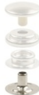
#24 Ligne Snap Fastener - POST

Finish: Stainless Steel, Pack Size: Pack of 100