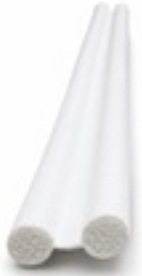
Blind-Seam Profile (Backtacking) Roll Size: Per Metre