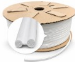
Blind-Seam Profile (Backtacking) Roll Size: 200m Roll