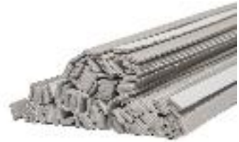
Cardboard Backtacking Strips (12mm wide) Pack Size: Each