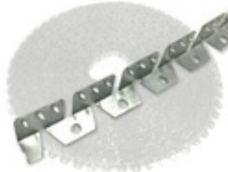
PlyGrip - Shark Trim (3 end prongs) Pack Size: Single Roll