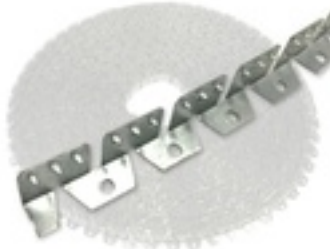
PlyGrip - Shark Trim (3 end prongs) Pack Size: Carton