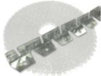
CoverFix - Shark Trim (2 centre prongs) Pack Size: Single Roll