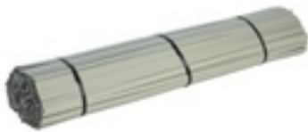
Cardboard Backtacking Strips (12mm wide) Pack Size: Pack of 1000